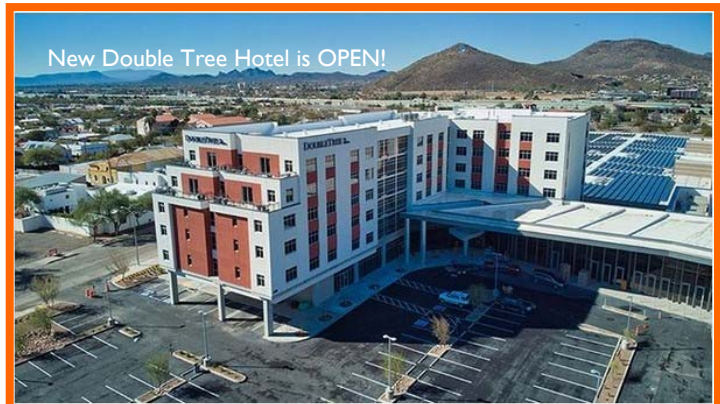
New Double Tree Hotel is OPEN!

Expect to hear more on this in the very near future when we come to the Membership for approval for some of the changes we may have to make ... and be ready with ideas when we ask for your input on clever ways to make them. The changes will be a challenge, but this is also an opportunity to launch our Show in new directions that can put us in front of the changes that are happening worldwide and locally in our hobby. With some work and luck we may find in the future that our 2022 TGMS Show was (to paraphrase Humphrey Bogart) "The Beginning of a Beautiful Realignment."