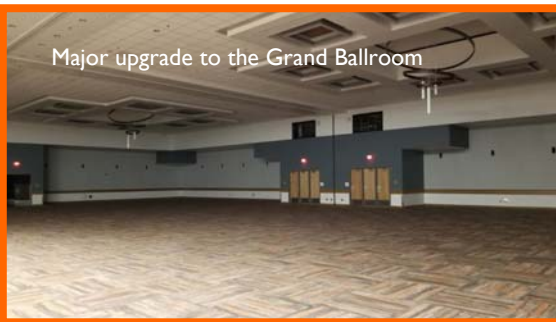
Major upgrade to the Grand Ballroom