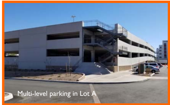
Multi-level parking in Lot A

In case you haven't noticed, a new center of mineral-related commercial gravity is evolving along Oracle Road between Grant and downtown with everything from repurposing of old factories to purpose-built facilities all designed for mineral sales. This realignment has been in progress for several years and would have happened anyway, but the process is accelerating thanks to Covid-19. This represents an opportunity for many dealers to refocus and reconcentrate their businesses and means that some of our long-time Show Dealers may choose to leave us.