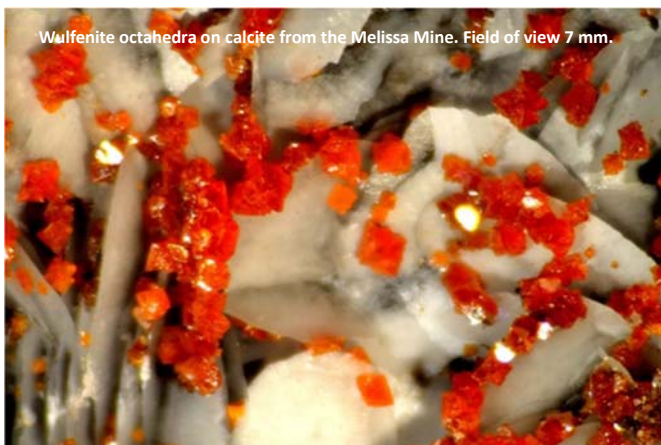
Wulfenite octahedra on calcite from the Melissa Mine. Field of view 7 mm.

Mindat also lists a Melissa mine in the Trigo Mountains of La Paz County, Arizona – the only other Melissa Mine that Mindat knows about. Could that be where this specimen comes from? Mindat provides quite a few photos of wulfenites from the Melissa mine in the Trigo Mountains, and those wulfenites are octahedral. The wulfenites on the specimen are quite small, but under high power, they are obviously octahedral, and that's unusual enough to make it likely that the location on the label is wrong.