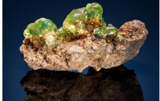
Electric Opal Zacatecas Shaded Sunlight

Marketed as Electric Opal™ in allusion to the color change phenomenon, free-standing lustrous botryoids make the most attractive specimens with individual druplets making stand-alone jewelry pieces. The material facets beautifully and the faceted, color-changing opals captured the immediate attention of the gemstone world. Research to characterize the material in detail was swiftly undertaken, led by Emmanuel Fritsch of