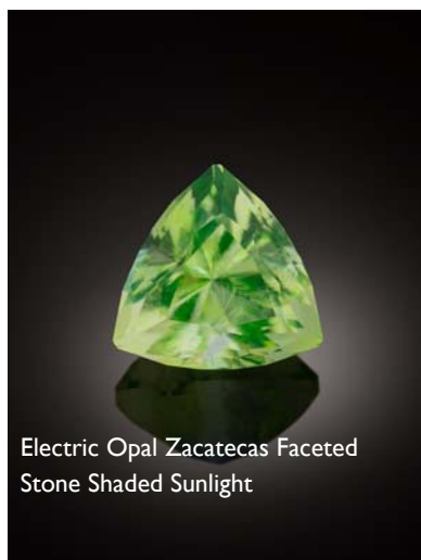
Electric Opal Zacatecas Faceted Stone Shaded Sunlight