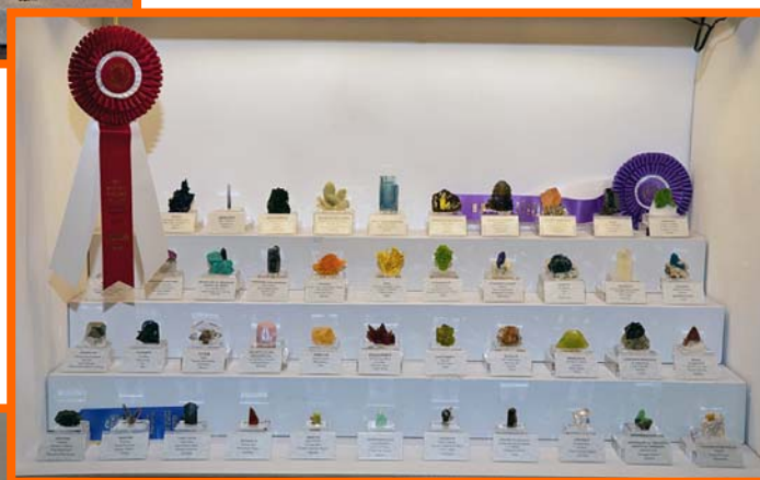
Phil Gregory - Desautels 2022 TGMS